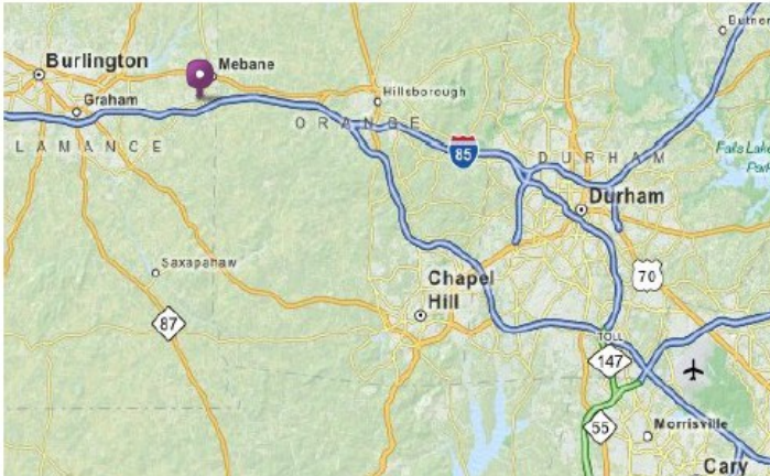
Relative Distances / Miles

Mebane Oaks Village / Lowes Anchor: Immediate Mebane Medical Park / Alamance Regional: .6 Tanger Factory Outlets (approx. 80 Stores): .7 Walmart Supercenter: .8 miles South Mebane Elementary School: 1.2 miles Library / Downtown: 1.8 miles